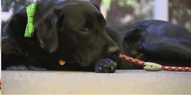
Working hard at school