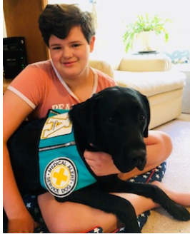
Headed to school