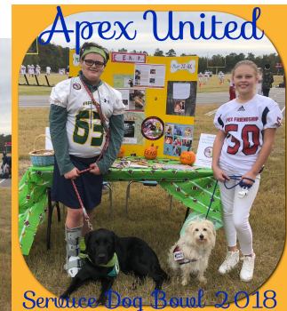
Sharing our stories!