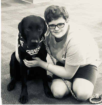
Summer Camp Success!