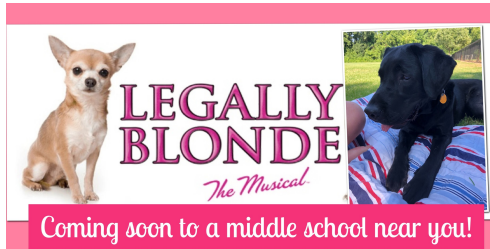
Our newest production!