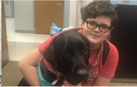
Middle School Success!